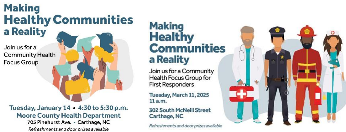
Figure 1. Social media marketing images for focus groups.

During this time, FirstHealth developed the protocol, facilitation guide, and participant demographic data collection tool for the focus groups. The CHNA team applied for and received an exemption from the FirstHealth Institutional Review Board (IRB) making this process exempt from requiring IRB approval to proceed. The team also worked with the health system's Strategic Marketing department to develop marketing materials (Figure 1) that could be shared digitally across social media platforms as well as through email and text messaging.