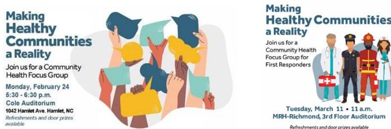
Figure 1. Social media marketing images for focus groups.

During this time, FirstHealth developed the protocol, facilitation guide, and participant demographic data collection tool for the focus groups. The CHNA team applied for and received an exemption from the FirstHealth Institutional Review Board (IRB) making this process exempt from requiring IRB approval to proceed. The team also worked with the health system’s Strategic Marketing department to develop marketing materials (Figure 1) that could be shared digitally across social media platforms as well as through email and text messaging.