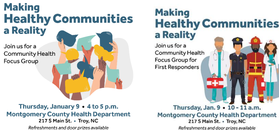
Figure 1. Social media marketing images for focus groups.

During this time, FirstHealth developed the protocol, facilitation guide, and participant demographic data collection tool for the focus groups. The CHNA team applied for and received an exemption from the FirstHealth Institutional Review Board (IRB) making this process exempt from requiring IRB approval to proceed. The team also worked with the health system's Strategic Marketing department to develop marketing materials (Figure 1) that could be shared digitally across social media platforms as well as through email and text messaging.